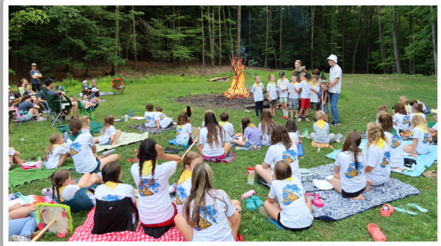
Scouts enjoying a campfire during summer camp

In 2023, Novyi Sokil had a busy schedule hosting various Plast events, including: Sviato Vesny led by the Kurin "Pershi Stezhi," novatkskyj vyshkil (counselor training camp), okružhni tabory (summer camp for scouts) in July, and in the fall, the annual meeting of the Kurin "Vovkulaky." We are happy to see the Plast community benefitting from Novyi Sokil as a venue for conducting all types of events.